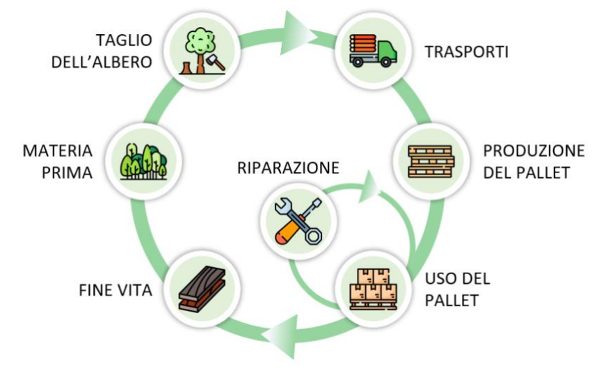
Figure 1 – Pallet life cycle

The LCA of the EUR/EPAL pallet was carried out pursuant to the current ISO standards. Specifically, the two LCA reference standards used were: ISO 14040:2006<sup>1</sup> and ISO 14044:2006.<sup>2</sup> As required by the relevant ISO standards, the analysis was conducted over four stages: Goal and scope definition; Life cycle inventory analysis (LCI); Life cycle impact assessment (LCIA); and Life cycle interpretation.